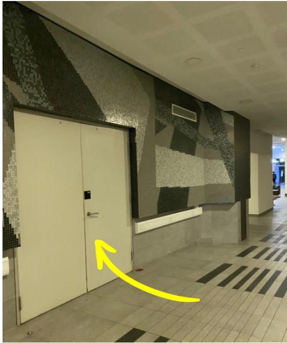
White Arrow – Bencoolen Entrance