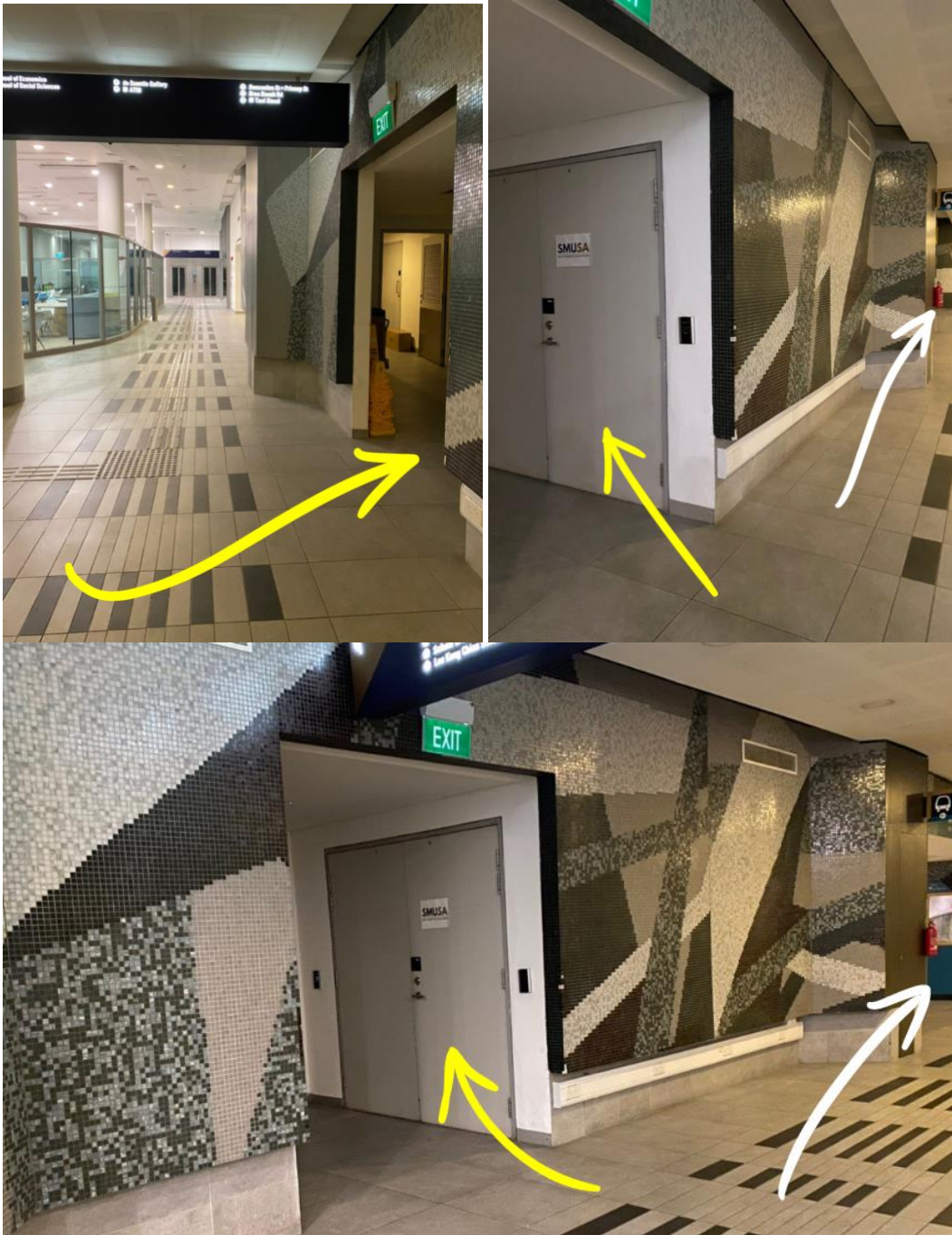
White Arrow – Bencoolen Entrance Yellow Arrow – SMUSA Store